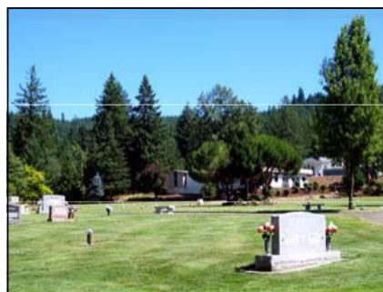
SPRINGFIELD MEMORIAL GARDENS