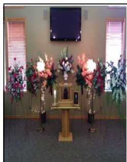
MUSGROVE FAMILY CENTER